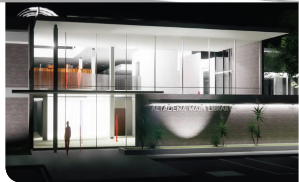
Main Library Preliminary Design

The special tax funding the building projects appeared on local property tax bills in October 2022.