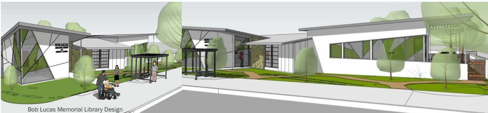
Bob Lucas Memorial Library Design